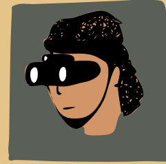
Night vision goggles 300–430 THz