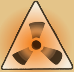
Radioactive decay >10 EHz