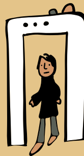
Airport security screening 0.2–4.0 THz