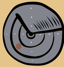
Military radar navigation 10 GHz