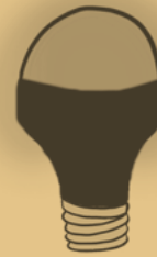
Black light bulb 800 THz