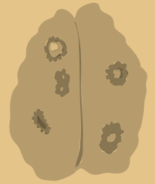
Brain scans >30 EHz