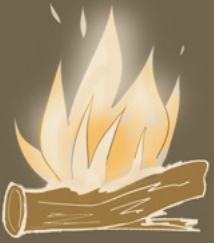
Thermal heat 30–2000 THz