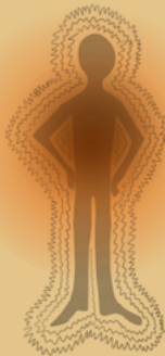
Human body heat 25 THz