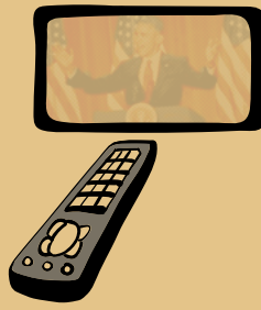
TV remote control 333 THz