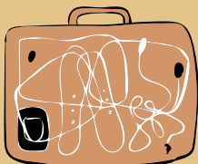
Baggage x-ray screening 30 PHz–30 EHz