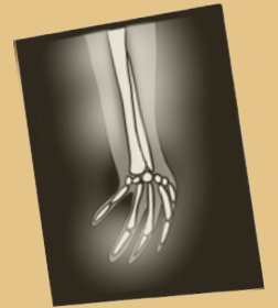
Medical x-ray exams 5–50 EHz