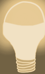
White light bulb 425–750THz