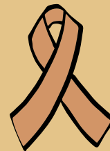
Cancer radiation treatments 500-5000 EHz