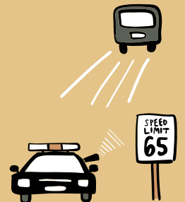
Police speed radar 24.125 GHz